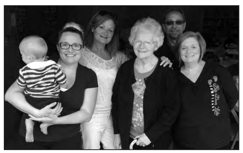
Page 4, Summer Edition 2016

Any owner or guest that willfully disregards these regulations will be asked to remove their pet from the camplands. Additionally, property owners are responsible for their pet and their guest's pet if involved in a threatening or physical incident. This may include a Code of Conduct, Reckless Endangerment, violation fine of $400. We would also ask that pets not be taken into the comfort stations and that you are considerate by cleaning up after your pet.