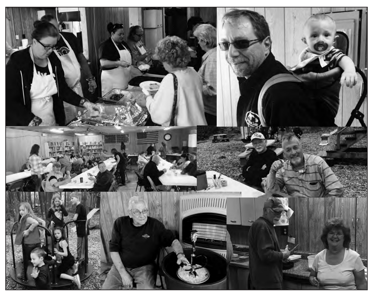
Page 7, Summer Edition 2016

The camplands and surrounding woods is the natural habitat of these animals. Please, respect the wildlife and the woods.