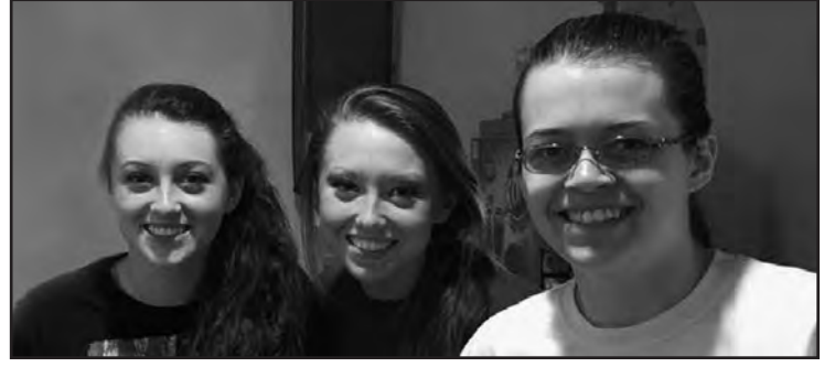
Page 9, Summer Edition 2016